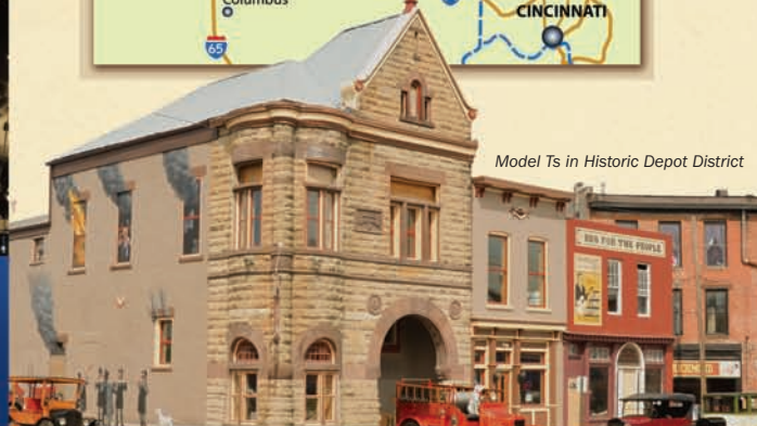
Model Ts in Historic Depot District