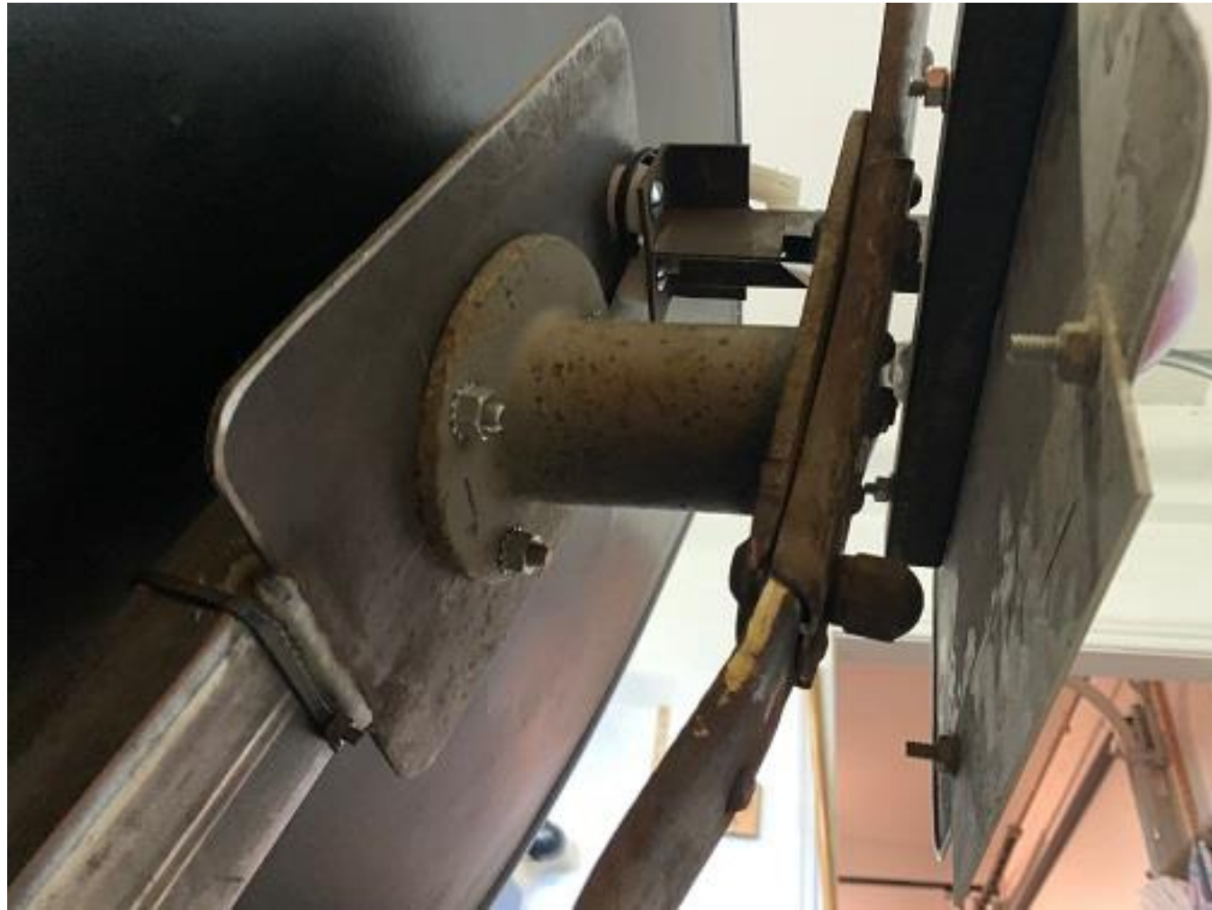
Attachment of Spare Tire & License Plate Brackets