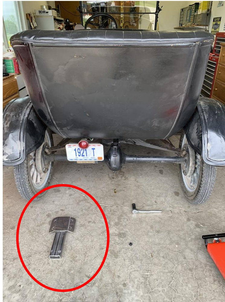
Initial Flange Plate Section – for fitting