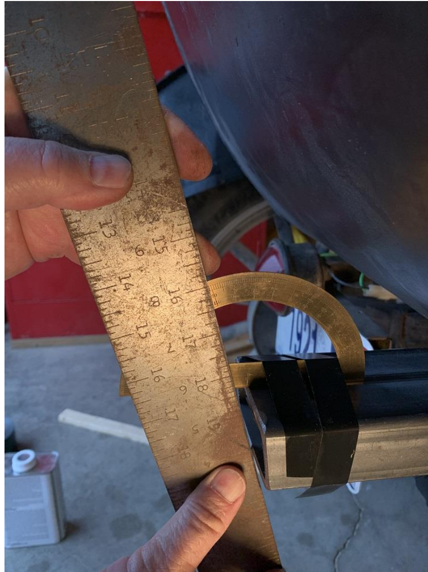
Initial Flange Plate Section – determining angle for vertical section