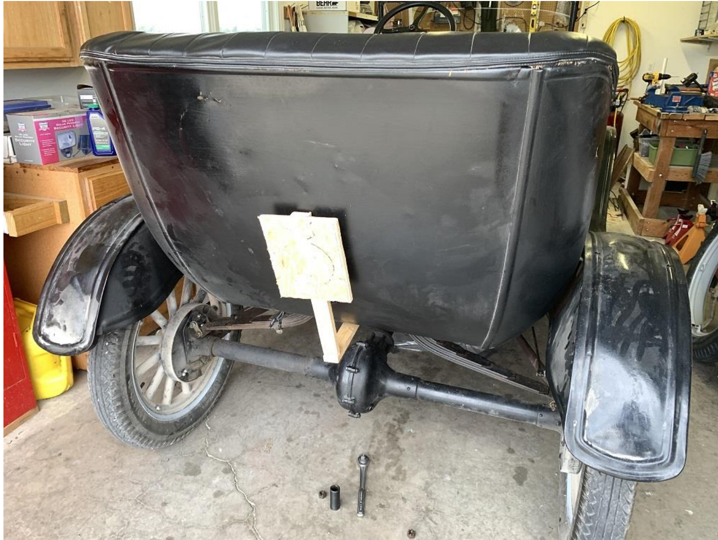
Mock-Up – Flange Plate & Frame