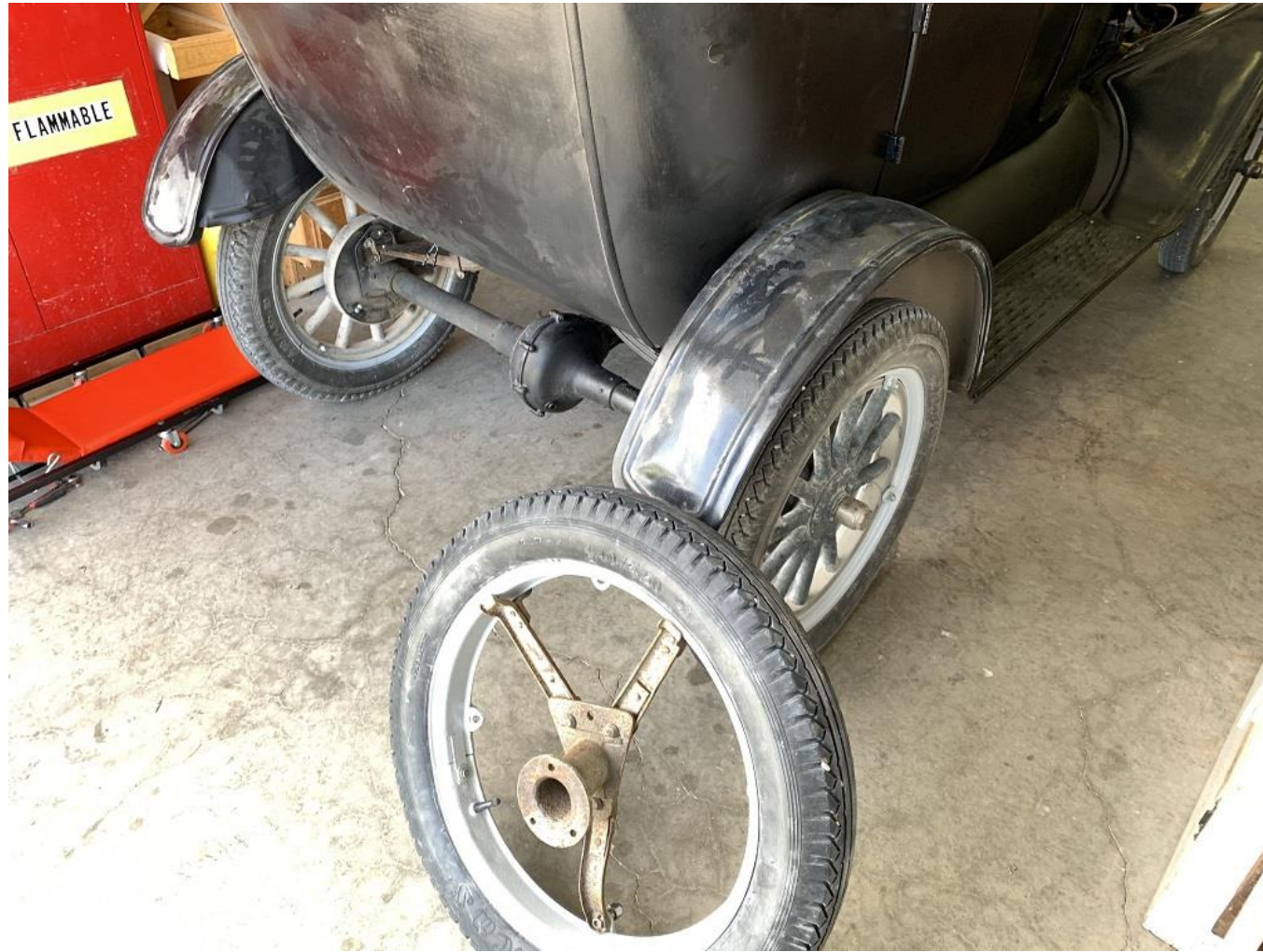
30" Spare Tire Bracket