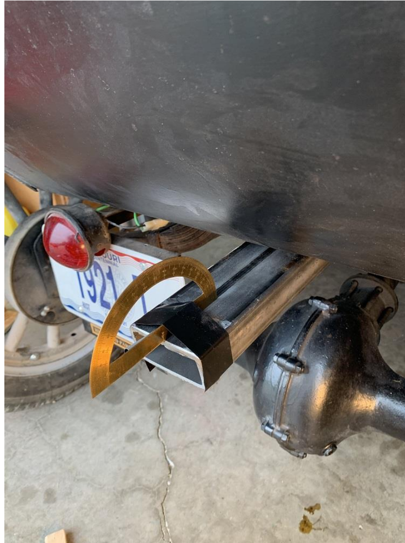
Initial Flange Plate Section – determining angle for vertical section