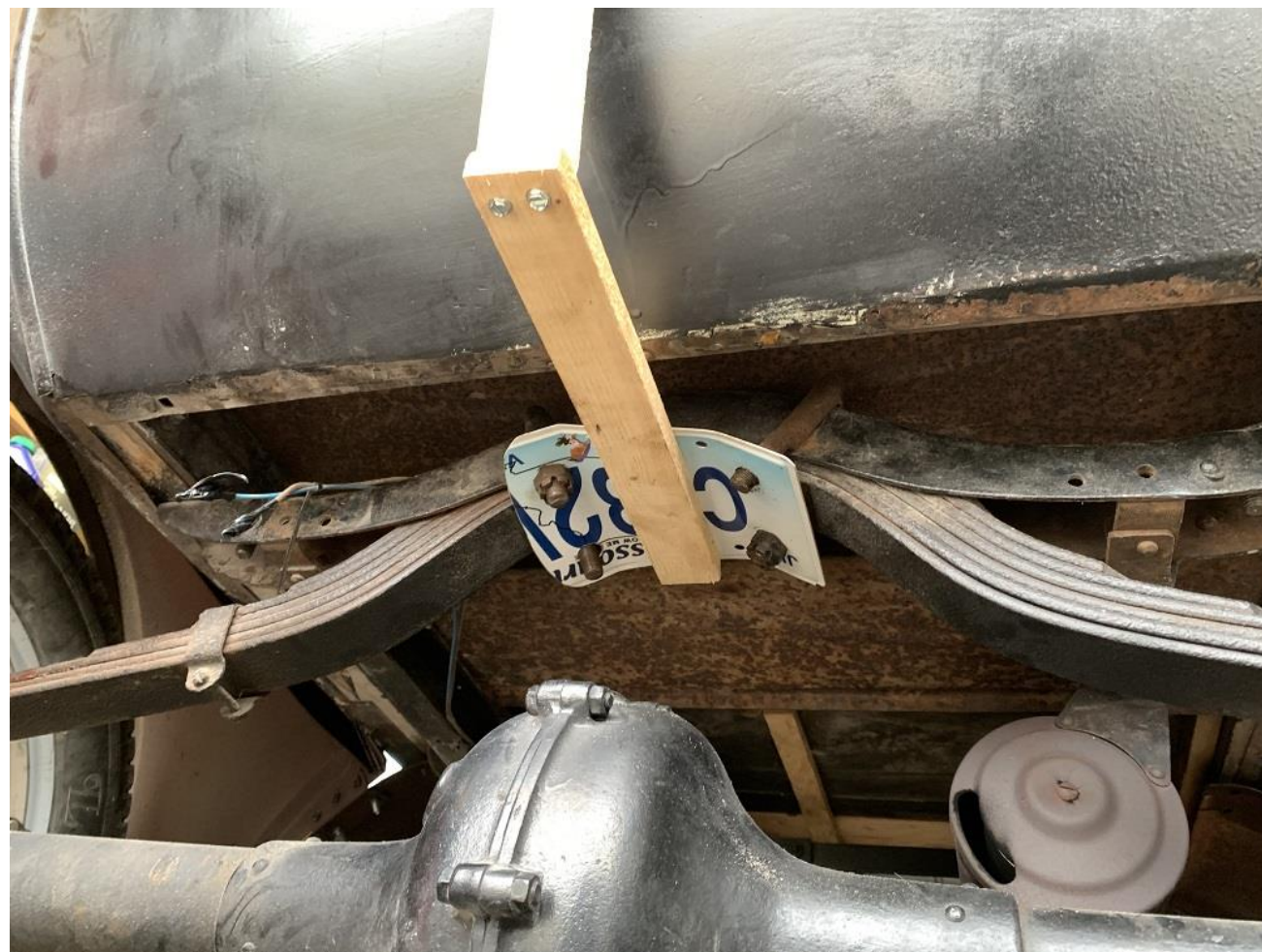
Mock-Up – Flange Plate & Frame